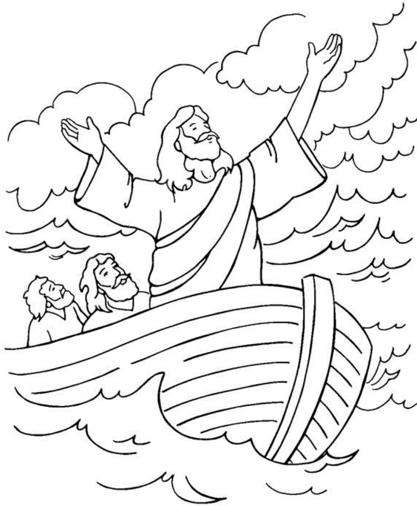
Jesus Calms the Storm

From Thru-the-Bible Coloring Pages for Ages 4-8. © Standard Publishing. Used by permission. Reproducible Coloring Books may be purchased from Standard Publishing, www.standardpub.com, 1-800-543-1301.